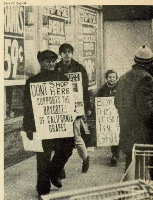
PICKETS OUTSIDE MARKET IN BROOKLYN