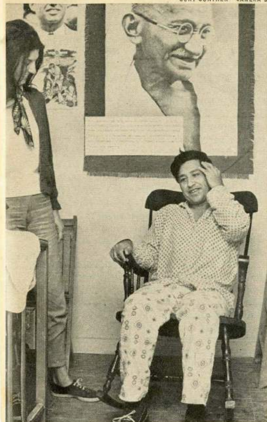
CHAVEZ UNDER PHOTO OF GANDHI Also Zapata, Nehru and King.

have signed; they could be marketed through the chain stores that have refused to handle the produce of struck growers. However, any such confusing procedure is bound to dilute the boycott's effectiveness.