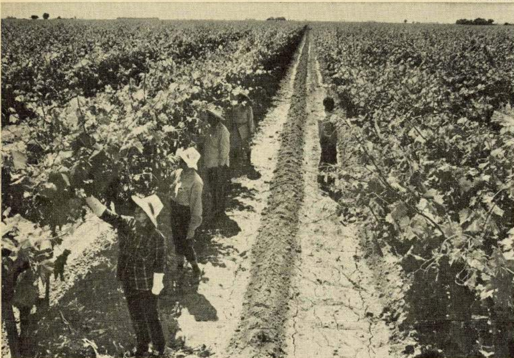
GRAPE WORKERS NEAR DELANO

Among the most unpleasant of human occupations.