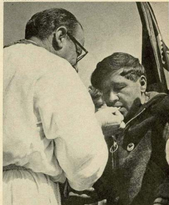
CHAVEZ ENDING FAST AT MASS Ideas mainly from the encyclicals.