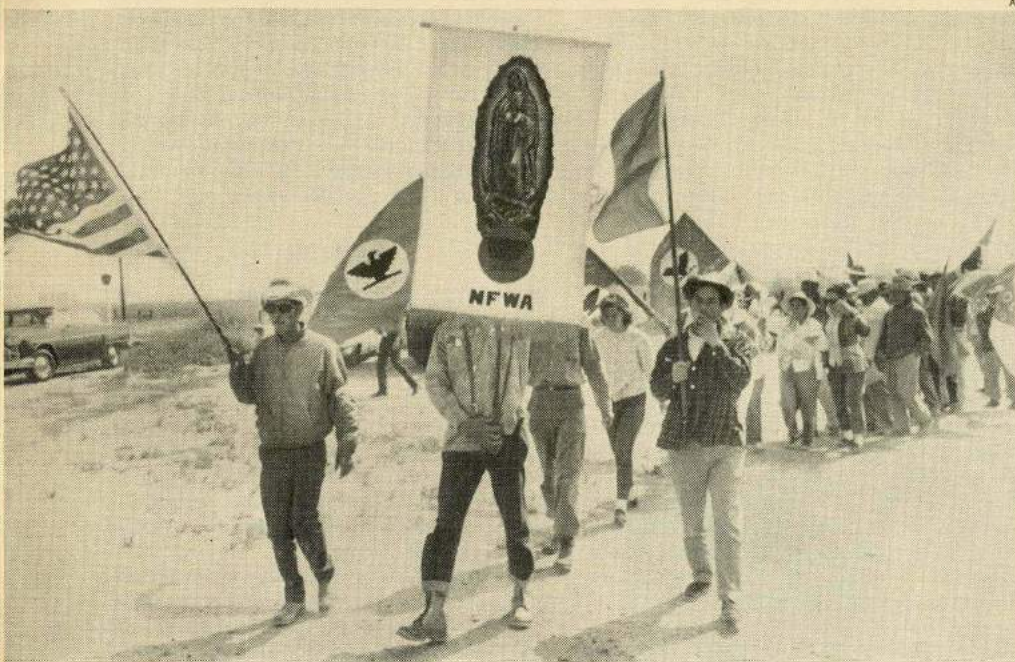
GRAPE STRIKERS MARCHING FROM DELANO TO SACRAMENTO