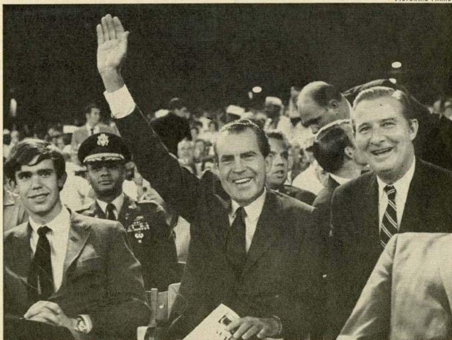
NIXON AT GAME WITH SON-IN-LAW & SHORT Stimulating and clears the mind.